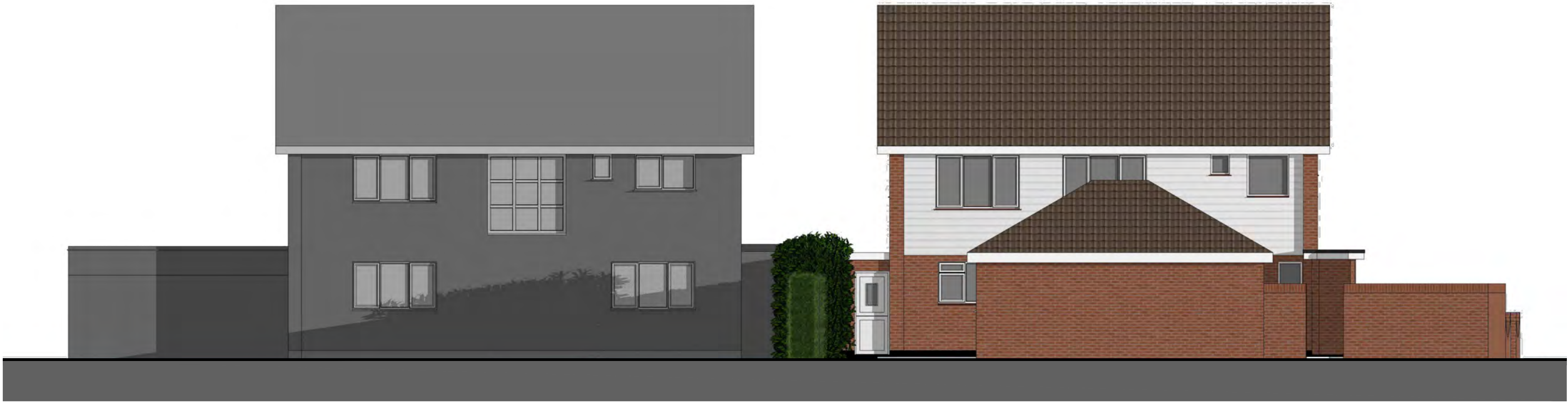
2 Existing Rear (North) Elevation Scale: 1:100