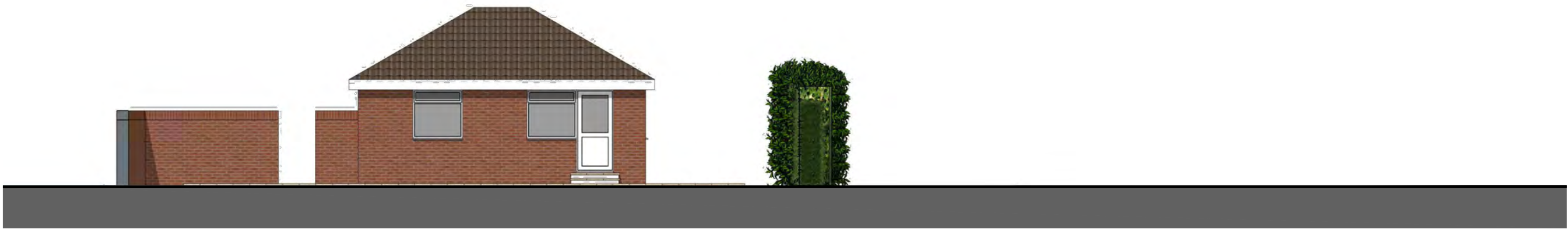
1 Existing Front (South) Elevation Scale: 1:100

Do not scale this drawing. Work to figured dimensions only. This drawing is copyright of APS Designs and should only be reproduced with their express permission. Check all dimensions on site. Any discrepancies should be reported to APS Designs prior to commencement.